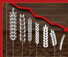
Climate Change: India's battle between economy and environment