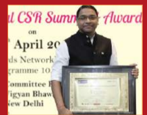
Fiinnovation wins Best Technical CSR Provider award