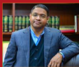
Fiinnovation, a CSR Innovation for the Future